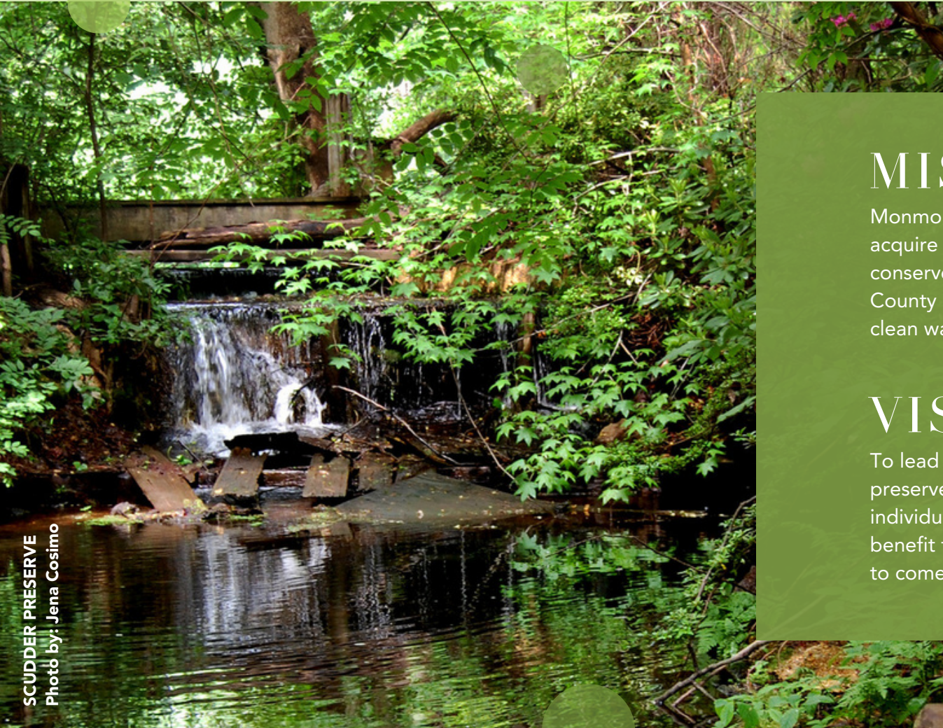
SCUDDER PRESERVE